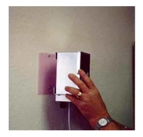
3. ROUTING CABLE FROM FAN TO KTA BOX

Either 25 or 50 feet of two conductor cable is supplied as part of the packaged system. This cable is to be used to supply the low voltage power to the fan. One end has a quick connect cable attached to it - this end is to be connected to the panel mounted socket on the side of the fan.