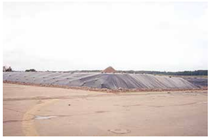
Construction Site Covers